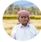
Extension and Outreach Club